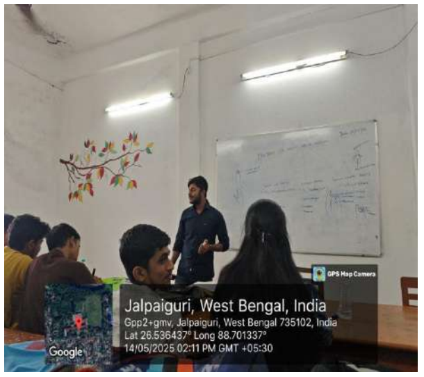
Photographs of 4<sup>th</sup> Semester students carrying out Peer Teaching Programme